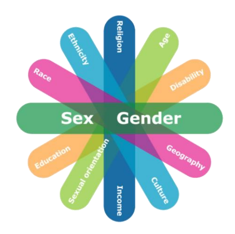
Reproduction of graphic produced by Status of Women Canada. Copy of version available at www.women.gc.ca

Analyzes research, lived and living experience, and perspectives of individuals and groups who differ by sex, gender, sexual orientation, gender identity, culture, age, race, ethnicity, ability and socioeconomic status;