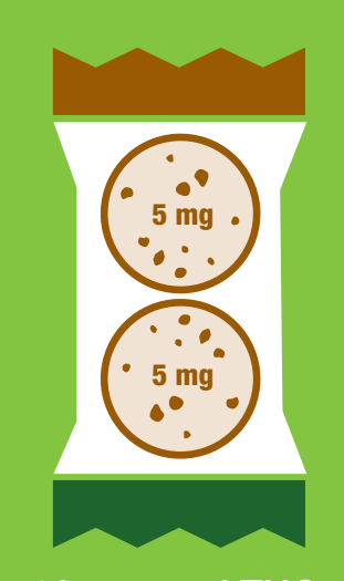
10 mg total THC 5 mg per edible