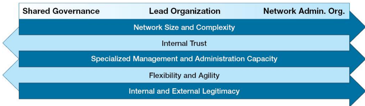
Figure 2: Governance Model Characteristics

There is no one ideal governance model. The models fall along a continuum in terms of function and fit with network characteristics, as illustrated in Figure 2. There is a natural trajectory to move from a shared governance approach to a lead organization or NAO approach as networks evolve, become more complex, and require additional expertise and capacity in leadership and administration. In the networks reviewed, a common theme in this trajectory is a grassroots network or strategic initiative adopting a more formal structure as part of receiving funding or secretariat support from a government or foundation.