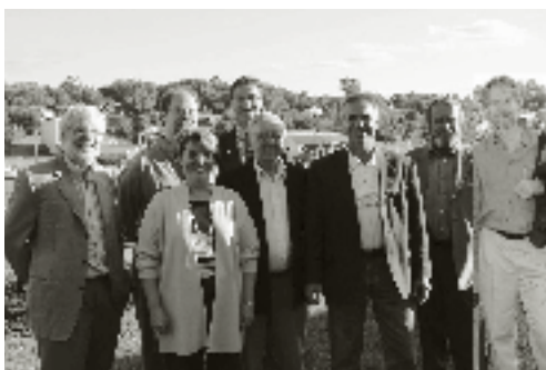
CCSA partnered with the Correctional Service of Canada (CSC) to inaugurate the National Summer Institute on Addictions in July 2003. Institute faculty are shown here at CSC's Addictions Research Centre in Montague, P.E.I.

Drug Strategy. The rejuvenated CDS promised a greater focus on community-based initiatives; education campaigns aimed at youth; new funding for research activities; and a biennial, national conference to set research, promotion and prevention agendas. The announcement meant the restoration of CCSA's funding base, but it also placed huge new demands on the Centre, including the hosting of a biennial conference that came to be known as Issues of Substance.